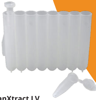
CleanXtract LV disposable cartridge, tube and tip sleeve.